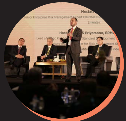
Risk Beyond 2018