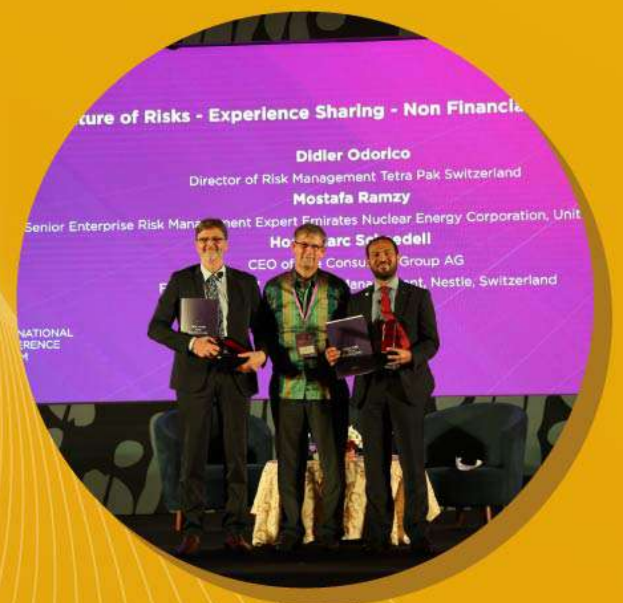
Risk Beyond International Conference 2017