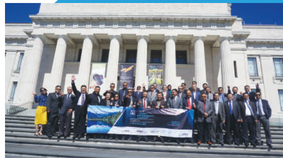
Group Picture in Auckland, New Zealand, September 19 th 2017