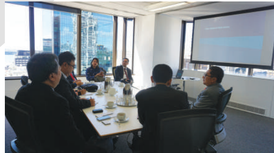
Institution Visit to Marsh in Auckland, New Zealand, September 19 th 2017

This program is designed to help participants in gaining knowledge on how ERM is being implemented and how it could help to create and protect value for the organizations in UAE with all their specific risks and challenges. It will be held in Dubai and Abu Dhabi, two most popular destinations in the country.