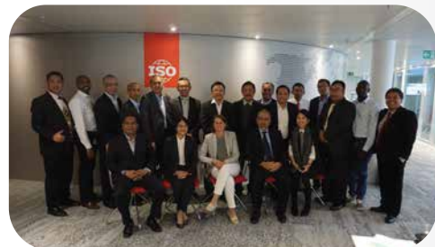
Meeting with ISO at Geneva, Switzerland on 25 April 2017