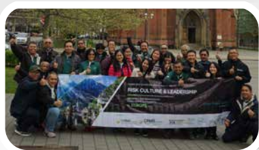
Previous Program Group picture in Europe, 22-30 April 2017

Jakarta, Indonesia - Auckland, New Zealand: +/- 11 hours 10 minutes