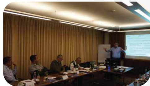
Master Class: Risk Culture & Leadership at Budapest on 28 April 2017