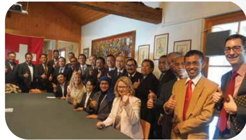
Meeting with Deloitte at Lausanne, Switzerland on 24 April 2017

To ensure that the refreshment process is effective, participants will receive a series of programs ranging from the GRC integration concept review followed by institution visits to see how the concept is practiced, as well as workshop and practice sharing with some practitioners and academicians in New Zealand.